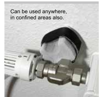
Can be used anywhere, in confined areas also.